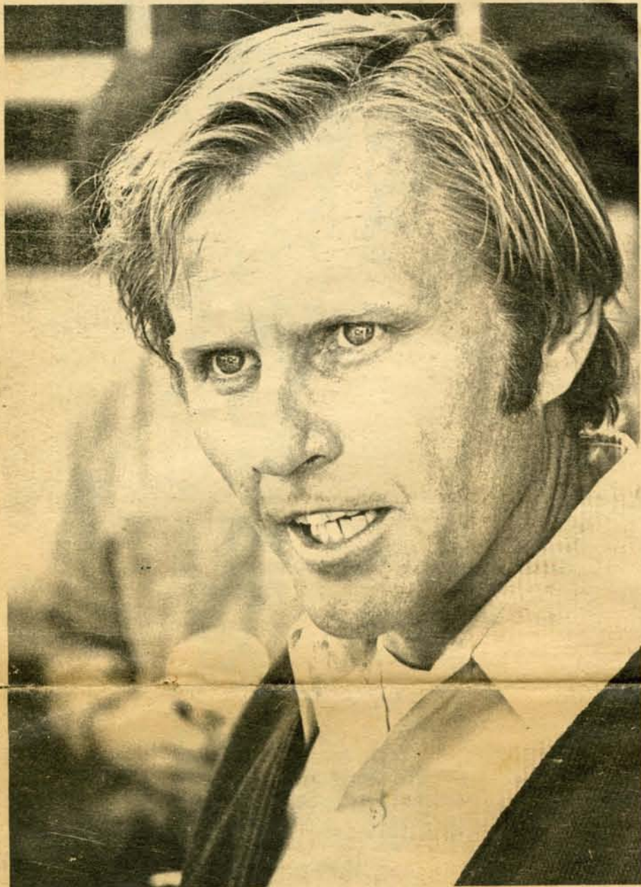
Jerry Pollock - Governor For A Better Arizona